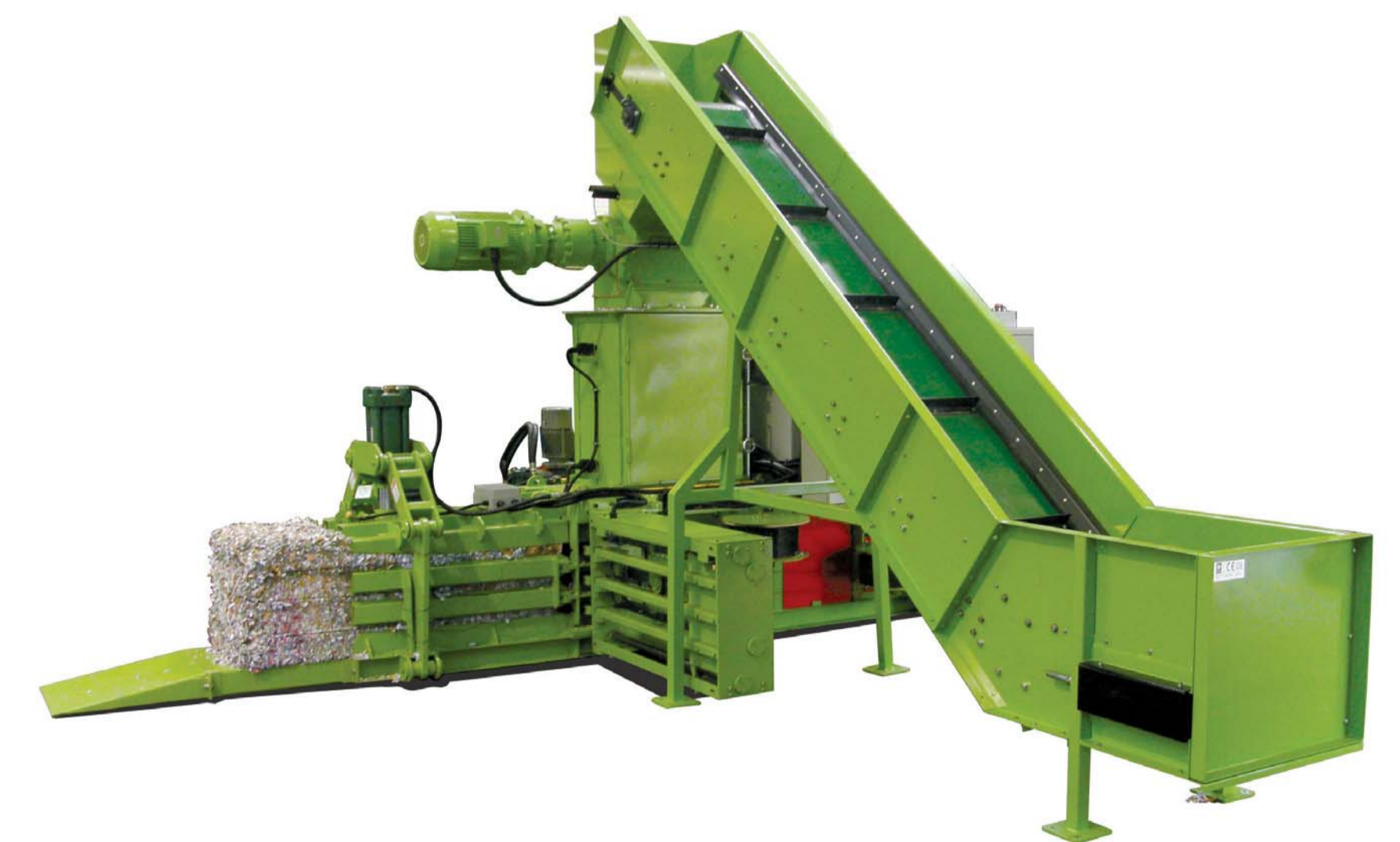
Conveyor + Shredder + Baler