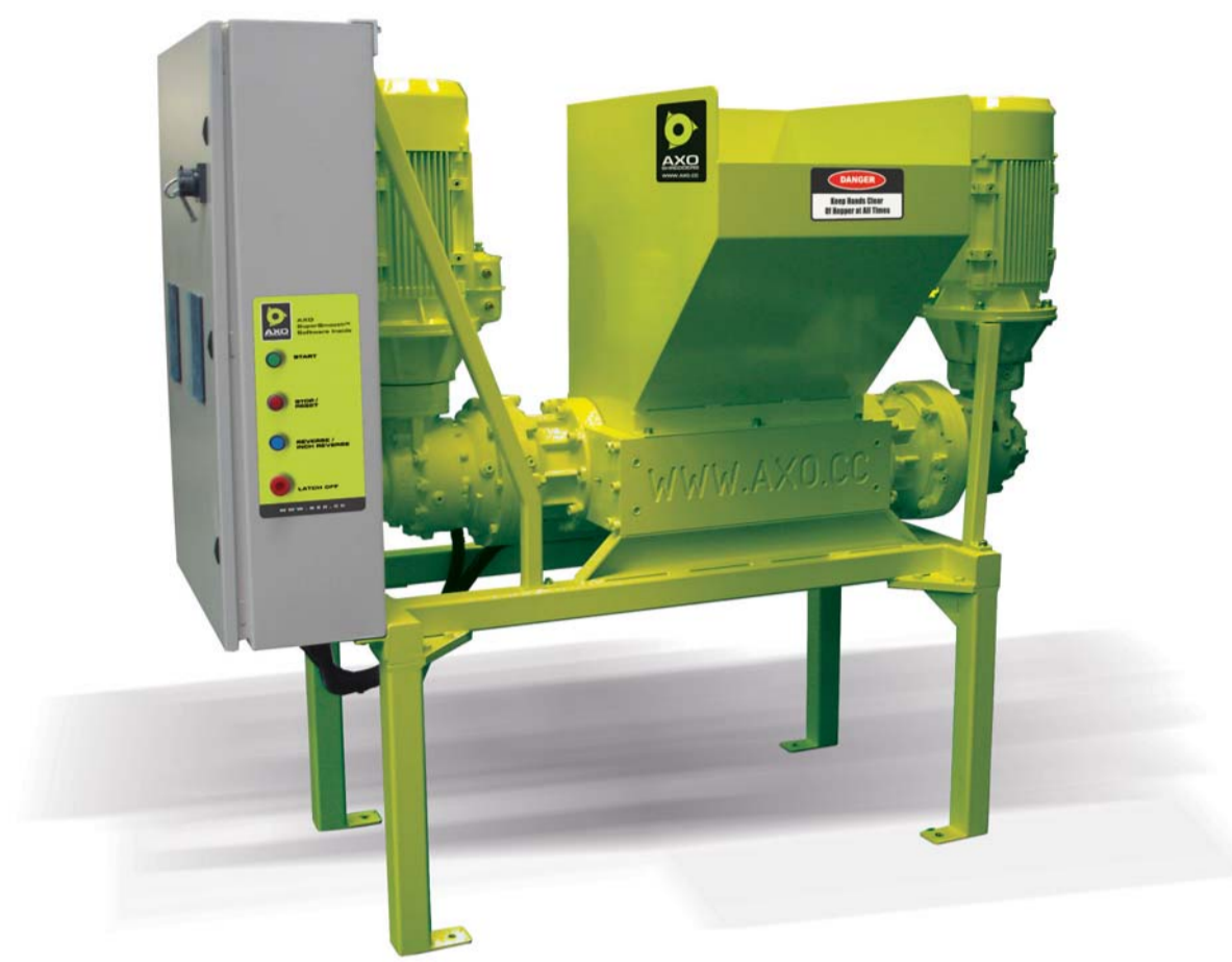
WM432E / WM608E